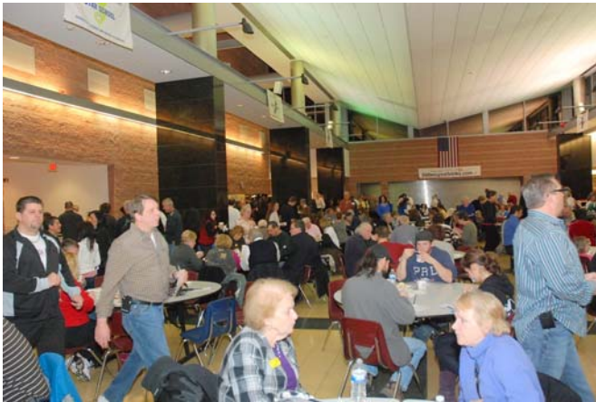
As you can see, there was a record turnout.