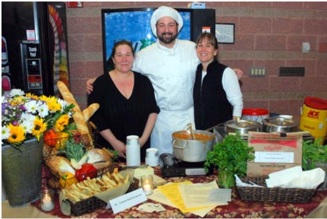
Photo of the Inn of the Hawk and their table, which received Best Presentation .

A special thanks to the Soup Cook-Off Committee members , which consisted of a combined effort from all five Hunterdon County Rotary Clubs as follows: