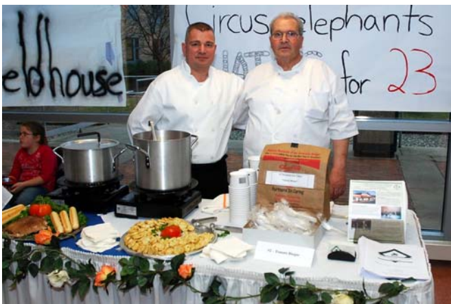
Photo of the Chefs and table presentation of the Mountain View Chalet .