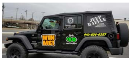
Rotary Club of Aberdeen, MD Raffling a 2016 Jeep Wrangler 4x4 Raffle Drawing on 9/12/2016