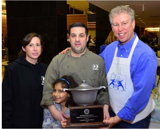
PHOTO ALBUM for the 2016 H.C. Rotary Soup Cook-Off Held on Monday, February 29

Click Here or on the photo to the left to view the Photo Album from the recent 2016 Soup Cook-Off event.