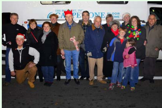
PHOTO ALBUM from the Main Street Christmas Tree Lighting Ceremony Held on Friday, December 5, 2015

Click Here or on the photo to the left to view the Photo Album from the recent Tree Lighting Ceremony.