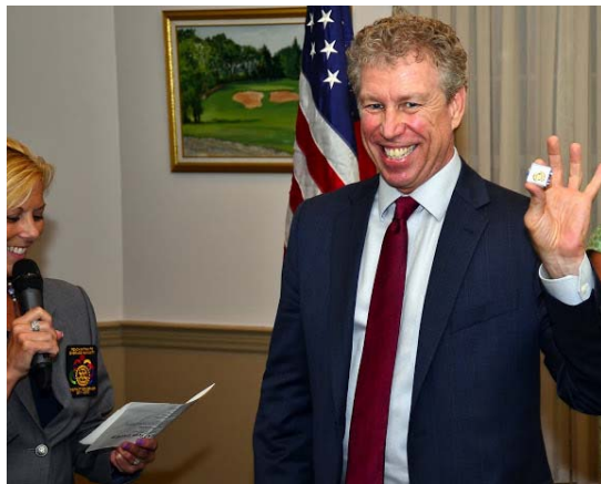
PHOTO ALBUM from the 2015 Changing of the Guard Dinner

To avoid sharing the names and years incorrectly, the full list will be included in next week's E-Monger. I apologize for the lapse in sharing this in this issue.