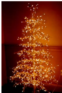
PHOTO ALBUM from the Rotary Holiday Party Held on Wed, December 3, 2014

A special thanks to Herb Bohler as well for taking the photos and generating the Picasa photo album.