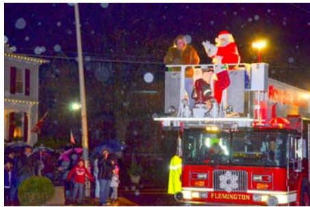
PHOTO ALBUM from the Main Street Christmas Tree Lighting Ceremony