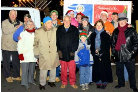
PHOTO ALBUM for the TREE LIGHTING & After-Party