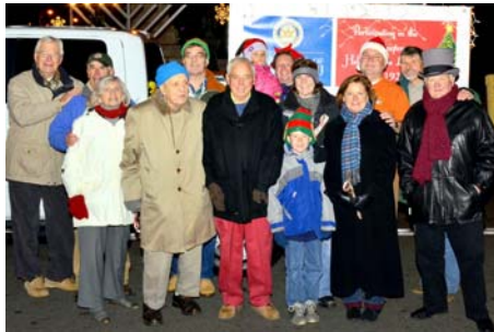
PHOTO ALBUM for the TREE LIGHTING & After-Party

The next Board Meeting will be held this coming Thursday night ( 12/5 ) from 6-7 pm. It will be held in the Conference Room at Hunterdon Prevention Resources, 4 Walter Foran Blvd., Unit 410, Flemington. ALL club members are invited to attend the meeting.