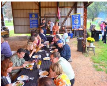
PHOTO ALBUM from the Rotary Club of Flemington's 90th Anniversary Picnic Held on Sun, 10/6/2013

If you are interested in either of the two upcoming FREE programs and workshops held here in Hunterdon County, CLICK HERE for all of the details.