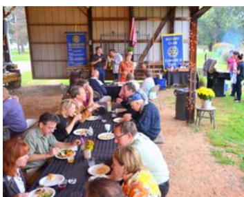
PHOTO ALBUM from the Rotary Club of Flemington's 90th Anniversary Picnic Held on Sun, 10/6/2013

If you are interested in either of the two upcoming FREE programs and workshops held here in Hunterdon County, CLICK HERE for all of the details.