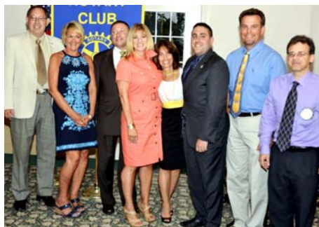
Photo Album - Changing of the Guard Dinner