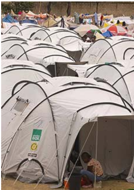
Here is the image of several tents setup. Note the Rotary International Logo on the tents, etc.