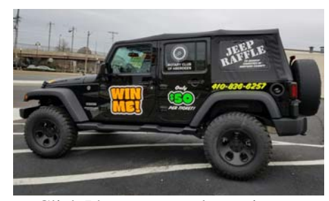
Click Photo to see a larger image

It costs $40 to collect, process, ship, rebuild and distribute each bicycle. The required $10 donation helps to offset the shipping costs. P4P is a 501(c)(3) corporation and a registered charity in the states of NJ, PA, NY, CT, IA & VT. Brochures explaining this innovative program will be available at the collection site. P4P also seeks donations of wrenches for our oversees shops. For detailed information about our overseas projects and a current schedule of bicycle collection, visit the P4P website at <a href="www.p4p.org">www.p4p.org</a>. If you miss this collection date, you can locate other bike collections through the Pedals for Progress website: <a href="www.p4P.org">www.p4P.org</a>