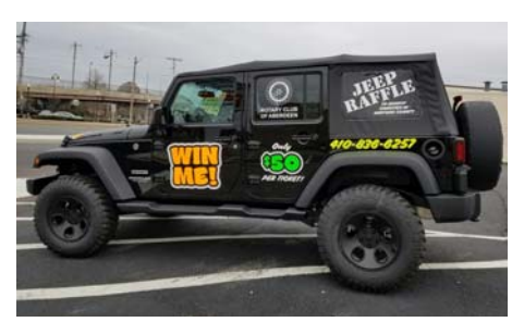
Click Photo to see a larger image

and sharing the photo. A special thanks to Wayne for officiating the induction.