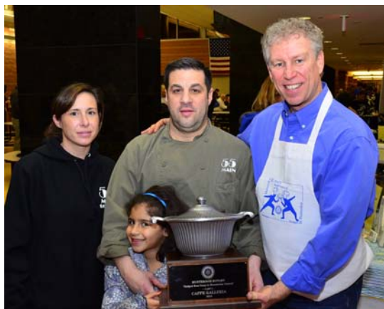
PHOTO ALBUM for the 2016 H.C. Rotary Soup Cook-Off Held on Monday, February 29

Click Here or on the photo to the left to view the Photo Album from the recent 2016 Soup Cook-Off event.