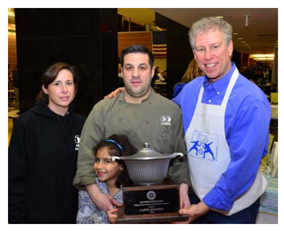
PHOTO ALBUM for the 2016 H.C. Rotary Soup Cook-Off Held on Monday, February 29

<u>Click Here</u> or on the photo to the left to view the Photo Album from the recent 2016 Soup Cook-Off event.