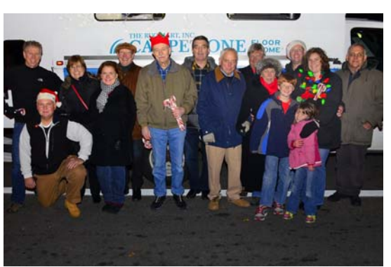
PHOTO ALBUM from the Main Street Christmas Tree Lighting Ceremony Held on Friday, December 5, 2015

A special thanks to Herb Bohler as well for taking the photos and generating the online album for everyone to view.