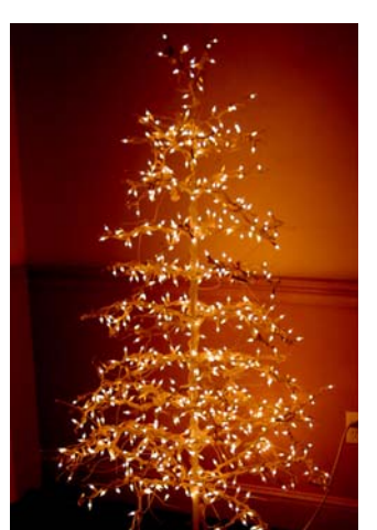
Flemington Rotary HOLIDAY COCKTAIL PARTY Thursday, December 10 Time: To Be Determined Caffe Cicchetti 19 Stangl Road - Flemington, NJ

Back in the 1920's, it was very difficult for children to get some candy and fresh fruit to eat. These days, we can readily purchase these items at our local Supermarket, etc. So it was a VERY BIG deal for the children in attendance to get their huge Candy Cane and Fresh Orange. Flemington Rotary has been annually helping with this project ever since!