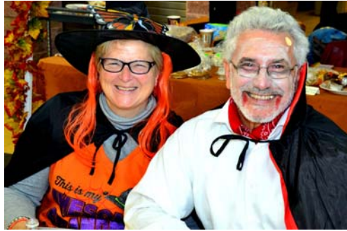
PHOTO ALBUM from the 41st Annual PANCAKE DAY, Costume Contest & Halloween High School Held Saturday, 10/31/2015