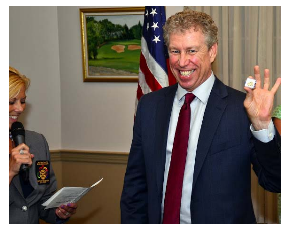
PHOTO ALBUM from the 2015 Changing of the Guard Dinner Held on Wed, June 24, 2015 Copper Hill Country Club

To avoid sharing the names and years incorrectly, the full list will be included in next week's E-Monger. I applogize for the lapse in sharing this in this issue.