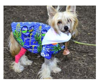
7th Annual Rotary DOG WALK Held on Sunday, June 7, 2015 Location: Flemington Boro Park

The Rotary Club of Flemington held it's 7th Annual Dog Walk, named "Bark in the Park", on Sunday June 8, 2015 in the Flemington Boro Park.