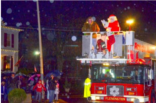
PHOTO ALBUM from the Main Street Christmas Tree Lighting Ceremony