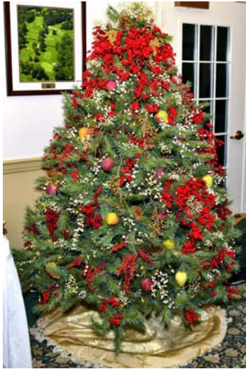
PHOTO ALBUM from the ROTARY HOLIDAY PARTY Held on Friday, December 13 Copper Hill Country Club

Wed, 1/08: OFFSITE Meeting at Blue Fish Grill - 50 Mine Street Wed, 1/15: OFFSITE Meeting at the Hunterdon Medical Center Wed, 1/22: OFFSITE Meeting at Bistro 161 - 161 Main Street Wed, 1/29: OFFSITE Meeting at Gallo Rosso Ristorante - 100 Reaville Ave