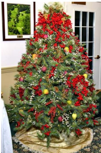
PHOTO ALBUM from the ROTARY HOLIDAY PARTY Held on Friday, December 13 Copper Hill Country Club

The Wed, January 1, 2014 regular club meeting has been canceled in lieu of New Years Day.